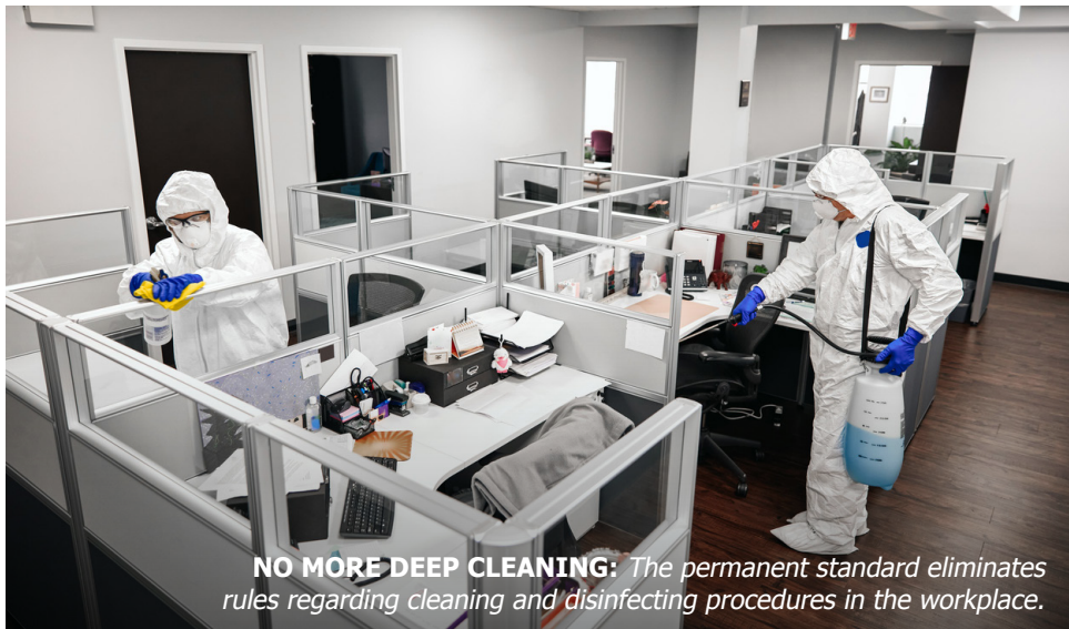
NO MORE DEEP CLEANING: The permanent standard eliminates rules regarding cleaning and disinfecting procedures in the workplace.

C AL/OSHA has taken the first step towards creating a semi-permanent COVID-19 standard to replace the emergency temporary standard that currently governs workplace coronavirus prevention measures in the state.